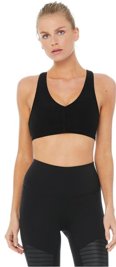
ALOSOFT BASE BRA