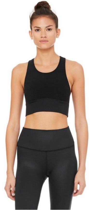
ALOSOFT SERENITY BRA