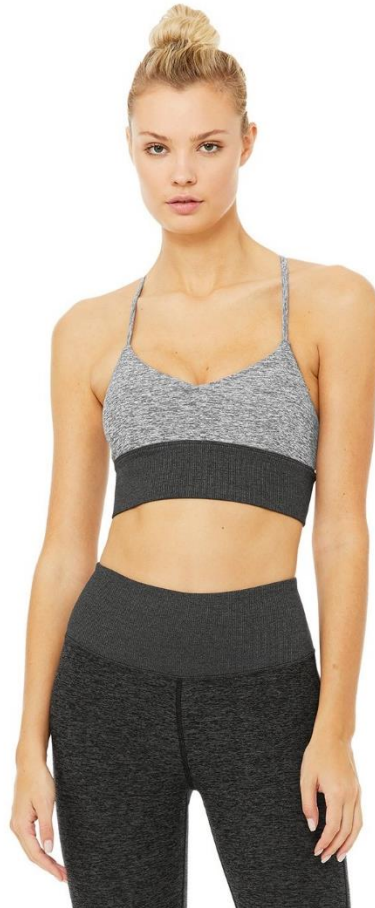
ALOSOFT LUSH BRA