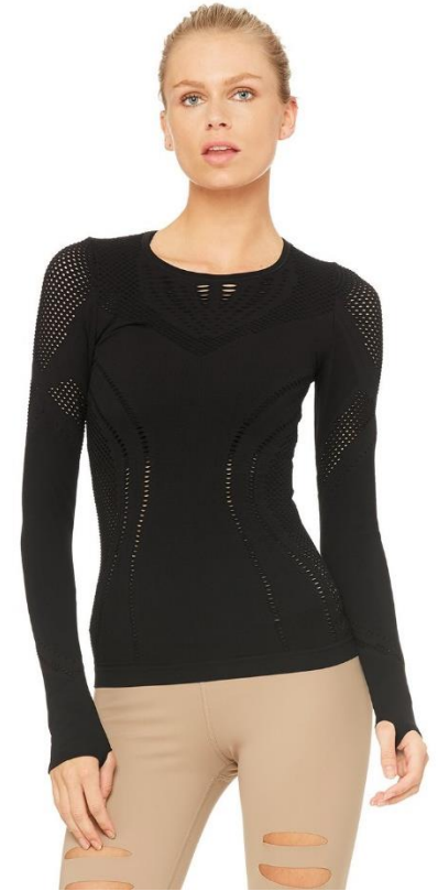
LARK LONG SLEEVE